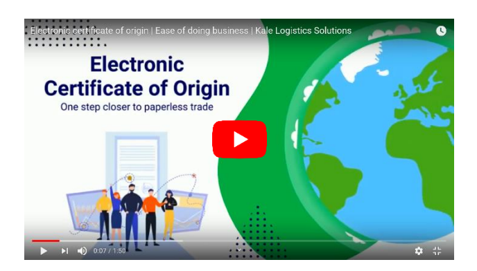
Electronic Certificate of Origin is the new Ease of doing Business