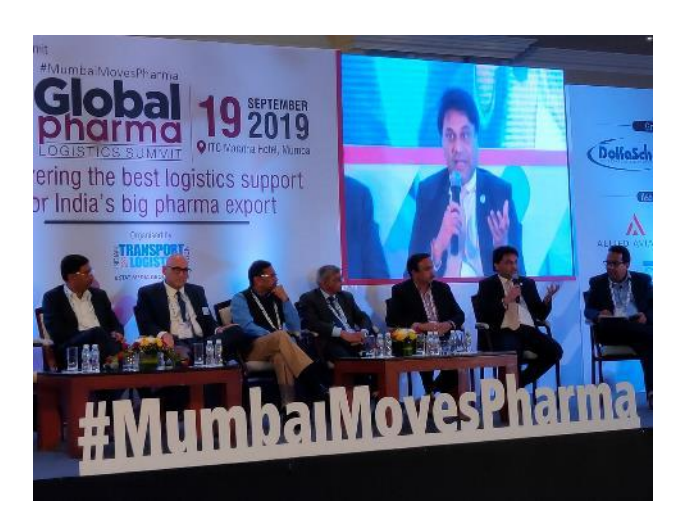
Global Pharma Logistics Summit 2019 ITC Maratha, Mumbai. September 19, 2019.