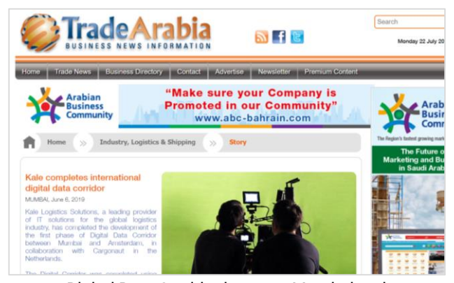
Digital Data Corridor between Mumbai and Amsterdam successfully completed by Kale Logistics Solutions and Cargonaut. <u>Know More</u>