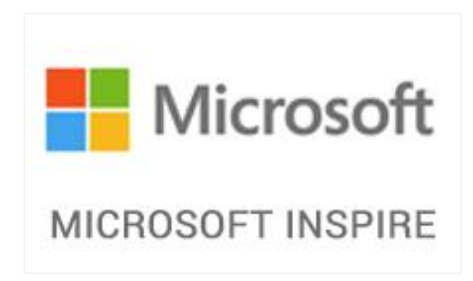
Microsoft Inspire 2019, Las Vegas, USA. July 14-18, 2019.